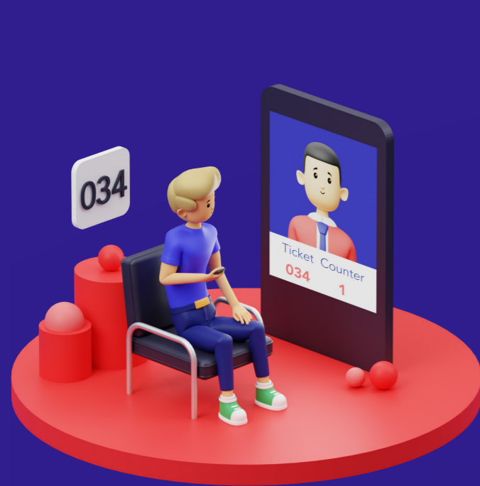
Queue Management System

Skiplino offers different products that cover different business needs: