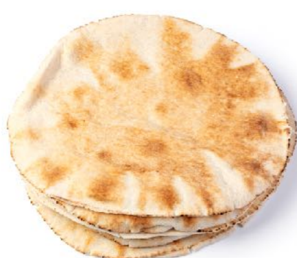
White Arabic Bread

75 g / 30' Thaw /Clean label / 100% Natural