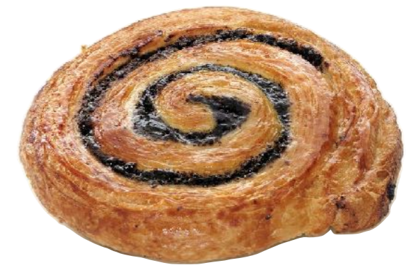
whirl with Chocolate

85 g / 30' Thaw /Clean label / 100% Natural