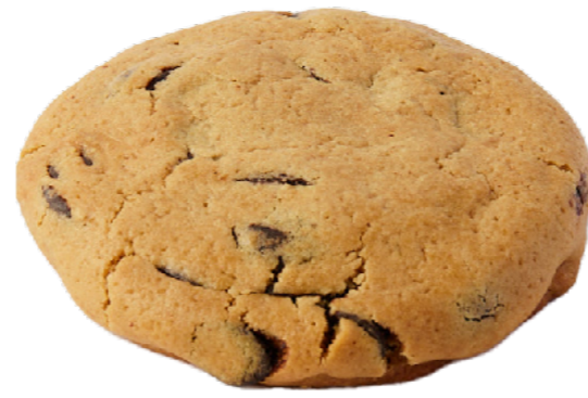
Chocolate Chips Cookie

55 g / 30' Thaw /Clean label / 100% Natural