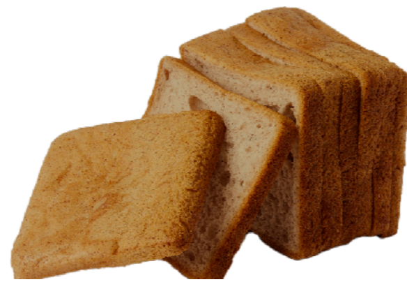
Brown Sandwich Bread

200 g / 45' Thaw /Clean label / 100% Natural