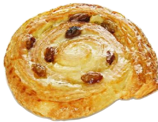
whirl with Raisins

65 g / 30' Thaw /Clean label / 100% Natural