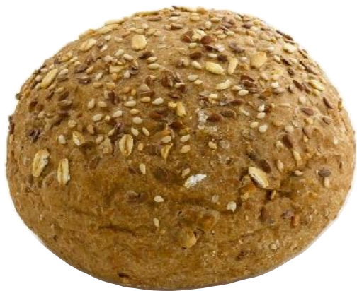
MultiSeed Burger Bun

200 g / 45' Thaw /Clean label / 100% Natural