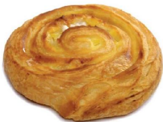
whirl with Custard

85 g / 30' Thaw /Clean label / 100% Natural