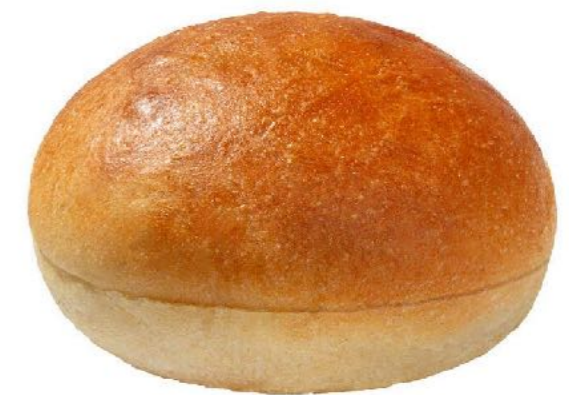
Plain Burger Bun

75 g / 30' Thaw /Clean label / 100% Natural