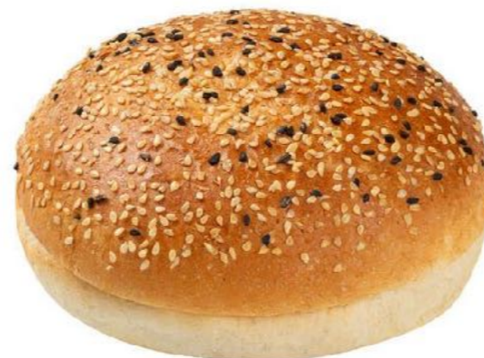
Nigella & Sesame Burger Bun

75 g / 30' Thaw /Clean label / 100% Natural