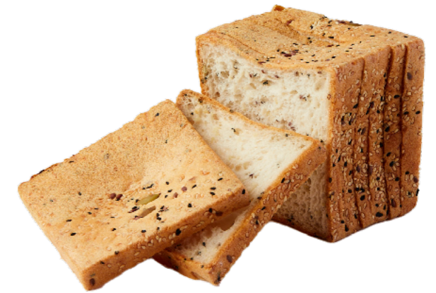
Multigrain Sandwich Bread

200 g / 45' Thaw /Clean label / 100% Natural