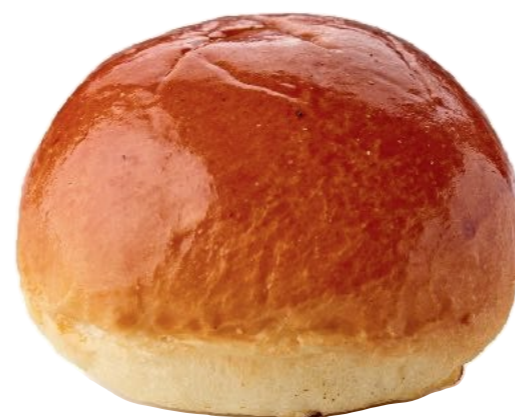
Brioche Burger Bun

75 g / 30' Thaw /Clean label / 100% Natural