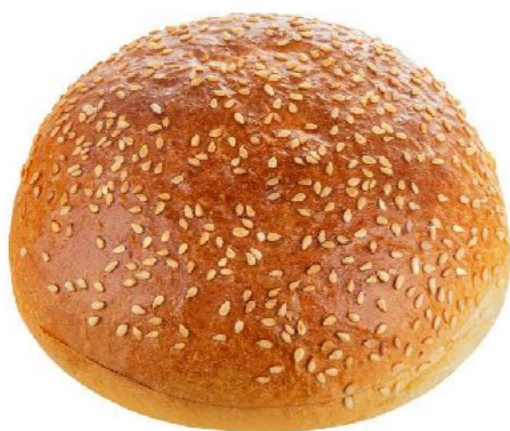
Sesame Burger Bun

75 g / 30' Thaw /Clean label / 100% Natural