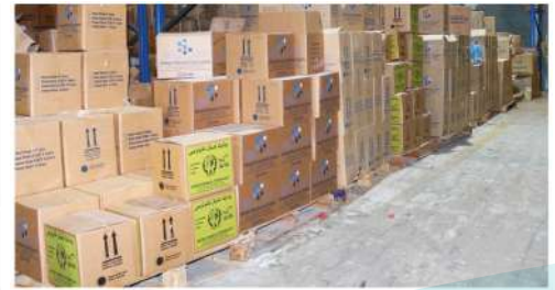
READY PRODUCTS FOR DELIVERY