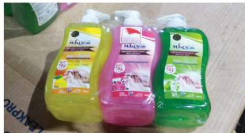
EFFICIENT PACKAGING EXECUTION