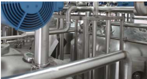
HIGH END MACHINERY