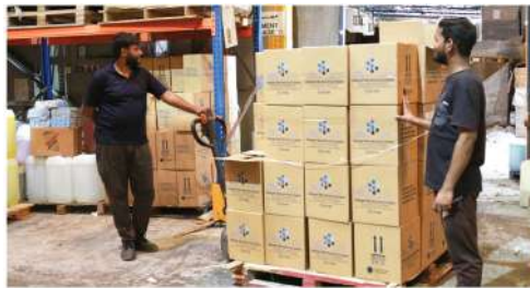
DEDICATED STORAGE SPACE