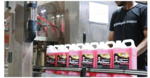
FILLING STATION FACILITY