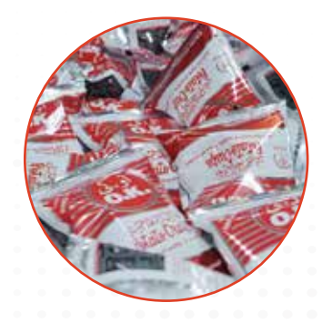
OK Crisps Chilli Flavour