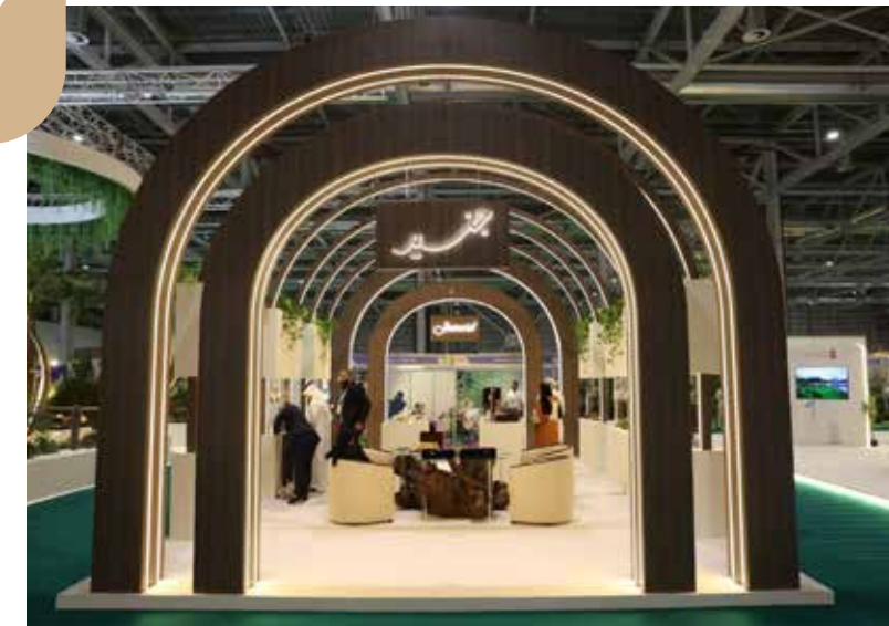
Garden Show 2023