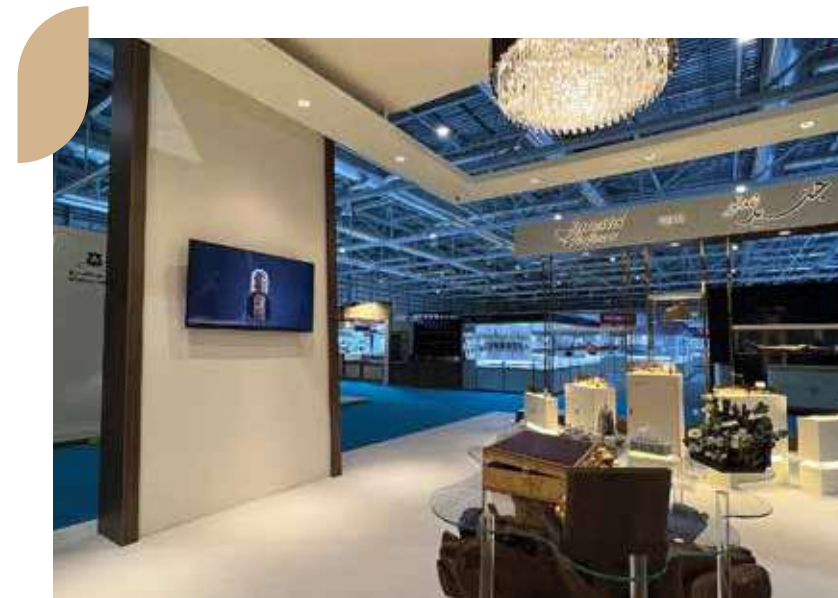
Jewellery Arabia 2022