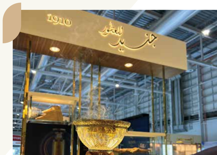
Jewellery Arabia 2022