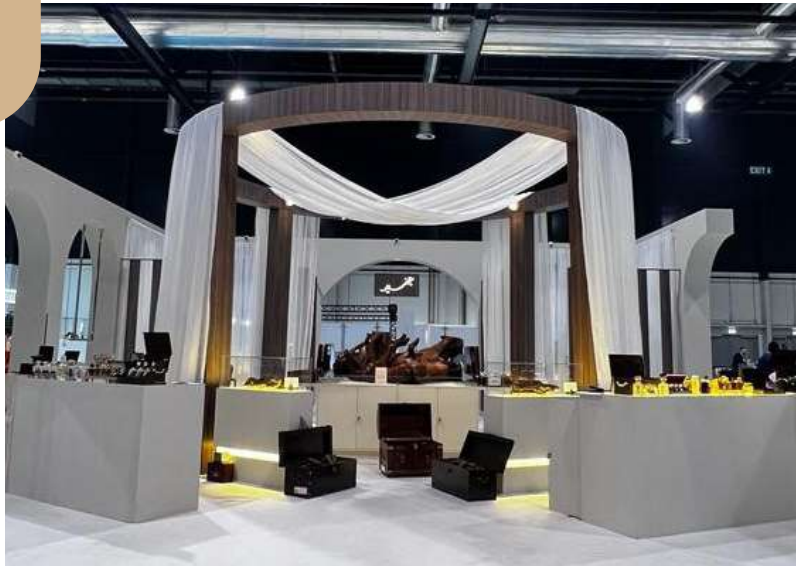
Jewellery Arabia 2023