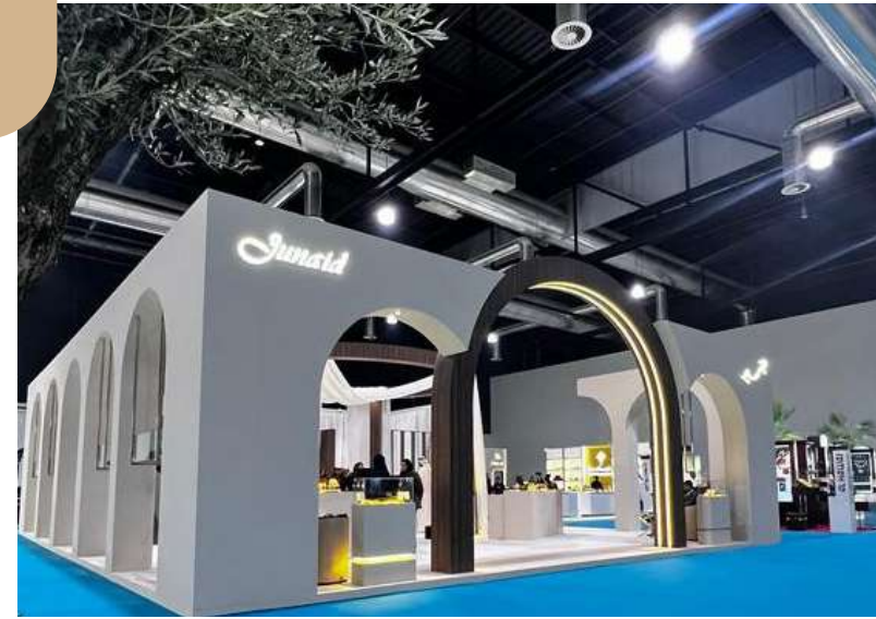
Jewellery Arabia 2023