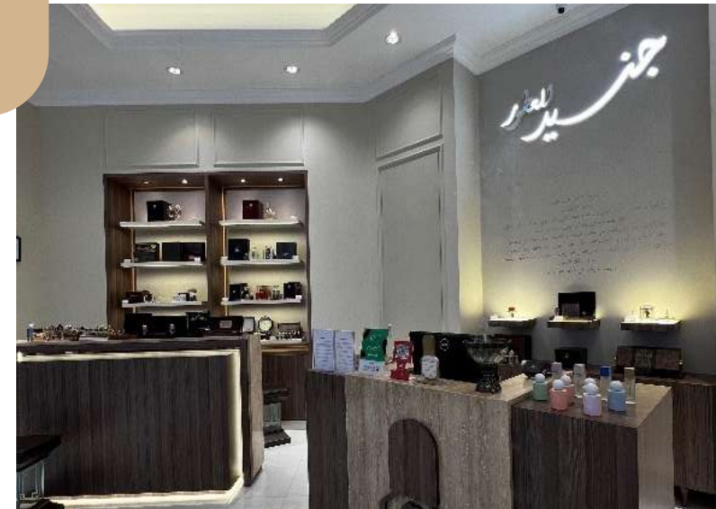
Seef Mall Muharraq