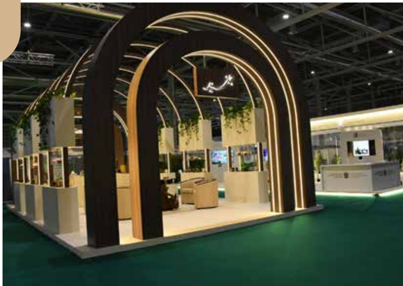
Garden Show 2023