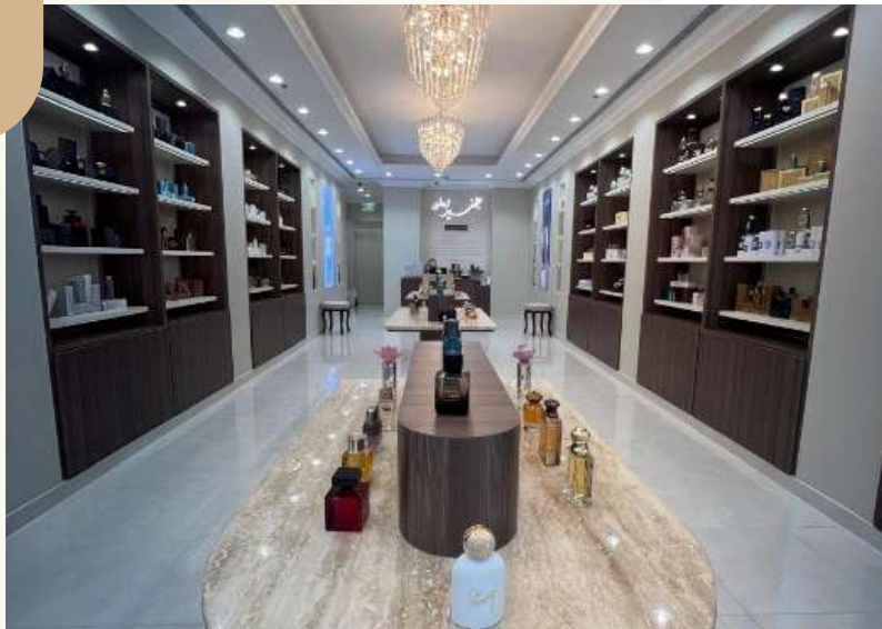
Red Sea Mall