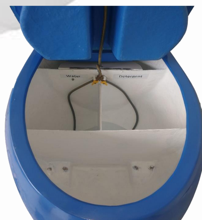
Storage and Tanks